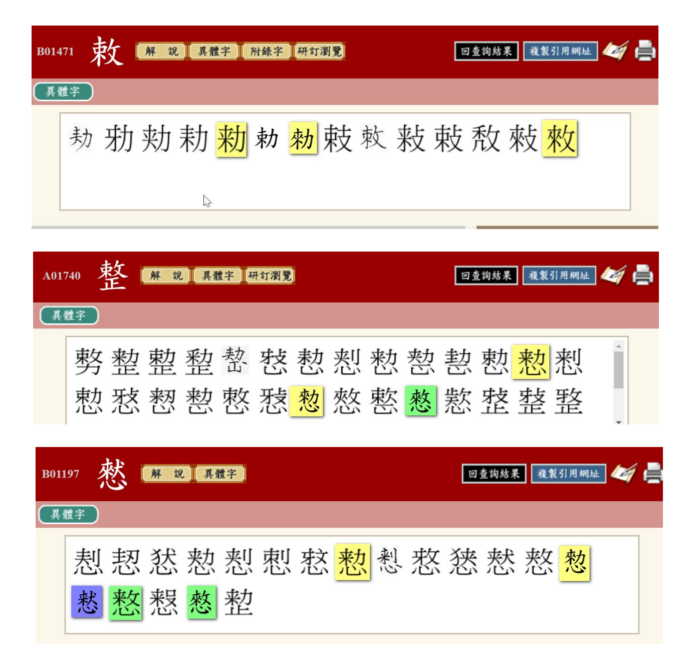
Figure 1: The MOE Variant Dictionary