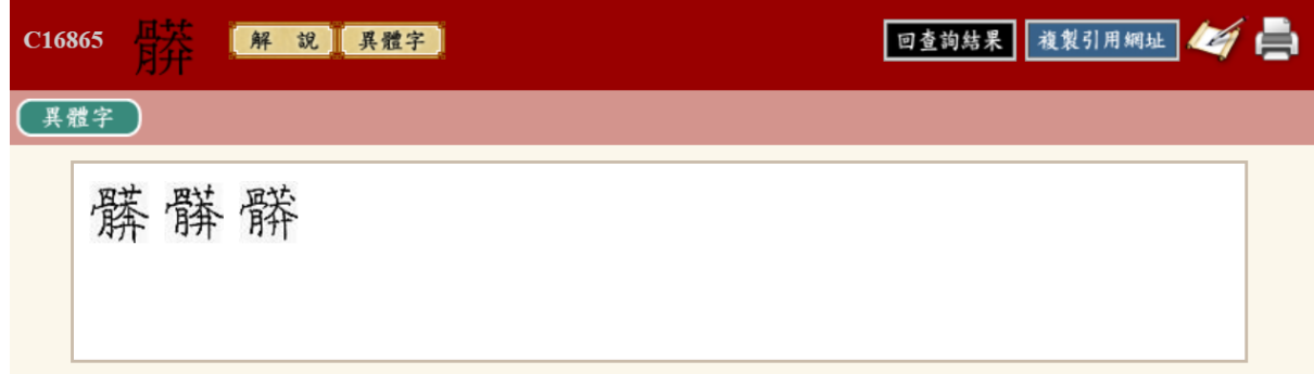
Figure 2: The MOE Variant Dictionary