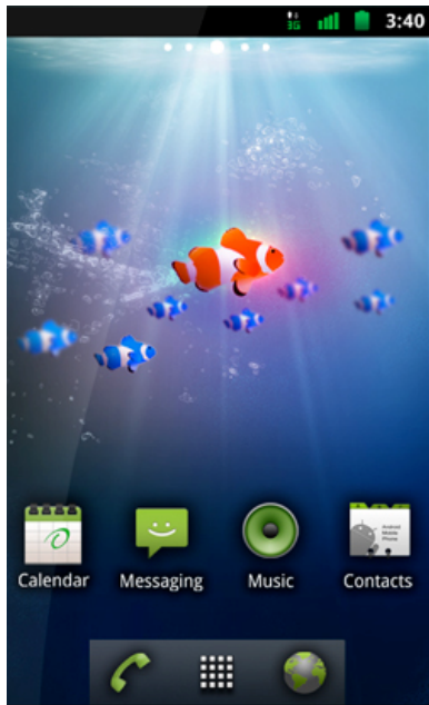
Figure 1. BeWell's ambient display of sensed health information, including representations of physical activity (the speed of the clownfish), sociality (the number of blue fish in the surrounding school), and sleep (the amount of light shining through the water).

$300 billion a year in absenteeism, diminished productivity, employee turnover and direct medical, legal and insurance fees” [2]. We have seen evidence of the relationship between the use of computing technologies and stress in our own empirical studies of information workers, as well, noting a correlation between use of e-mail and increased stress levels (as measured by heart rate variability) [6].