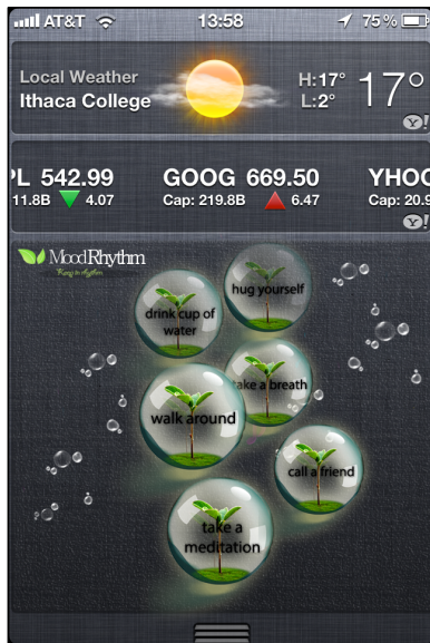
Figure 3. An early-stage mockup of our MoodRhythm app, designed to assist individuals with bipolar spectrum disorder in monitoring and managing their stress levels and moods.

self-reflection, embedding this kind of sensed health information in the tools that are already used everyday may help to prolong engagement with the system and enable self-reflection about health and stress in a more grounded, and, therefore, more actionable manner.